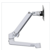
LX Arm, Extension and Collar Kit 98-130-216