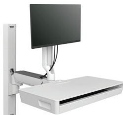
CareFit Combo System with Worksurface 45-619-251