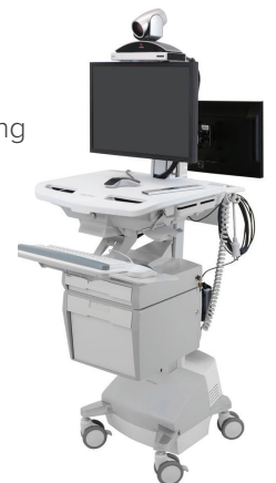
StyleView® Telemedicine Cart Dual Monitor, Powered SV44-57T1-1