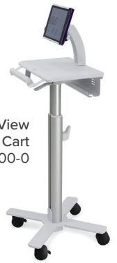
StyleView Tablet Cart SV10-1400-0