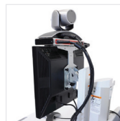
StyleView Camera Shelf 97-776-194 (Compatible with CareFit and StyleView)