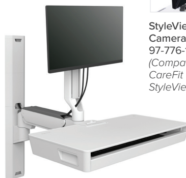
CareFit Combo System with Worksurface 45-619-251