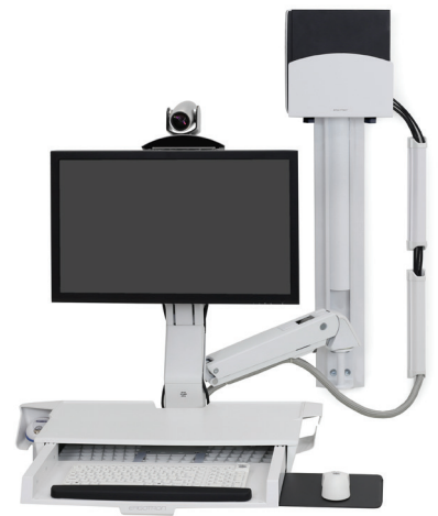
StyleView Sit-Stand Combo System with Worksurface 45-594-216

Download additional resources at ergotron.com .