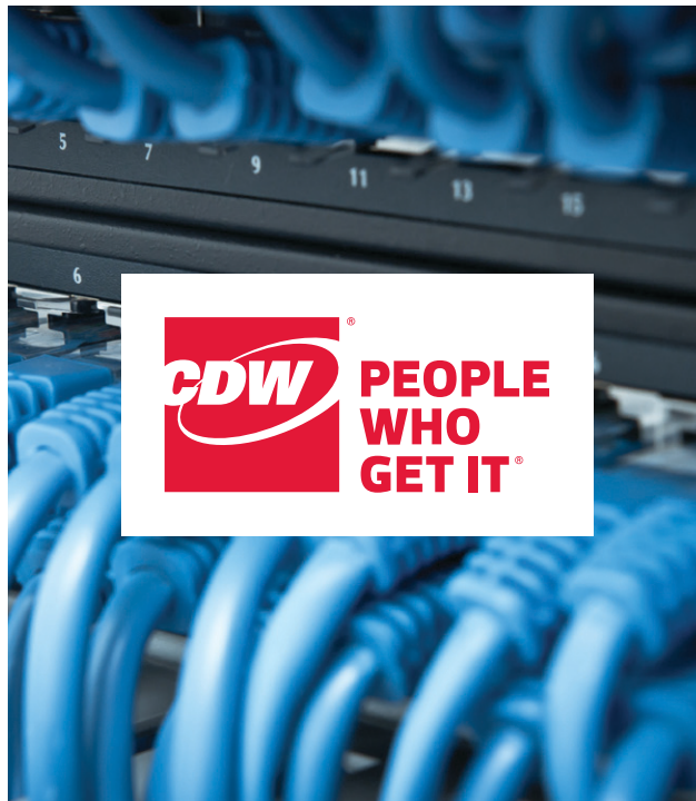
CDW Logo, On Field