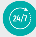
24/7 Technical Support