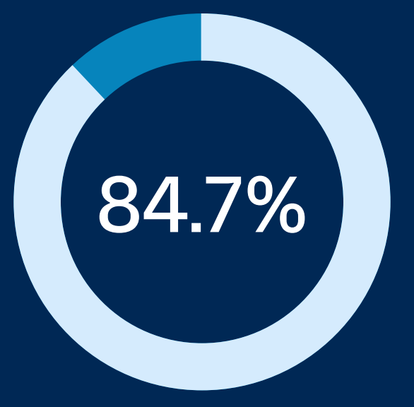
of enterprises currently use or plan to use a <u>cloud PBX</u> within the next 2 years