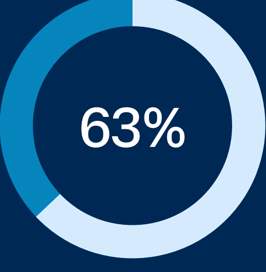
of employees want to work from anywhere after the pandemic