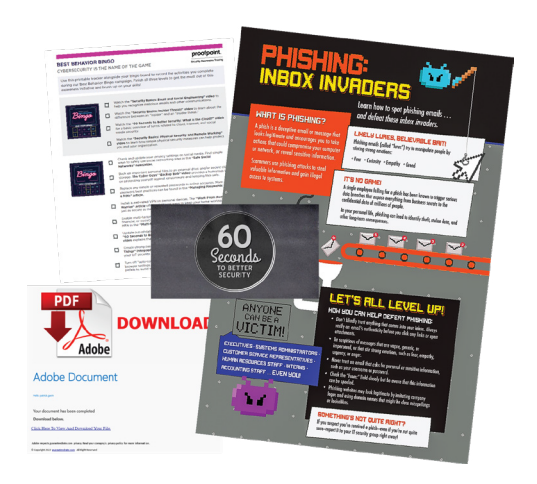
Figure 3. Proofpoint features a wide array of educational styles and formats to cater to your users' best learning needs.

to stay vigilant against the next attack. This is available to everyone, regardless of an integration with Proofpoint Targeted Attack Protection (TAP).