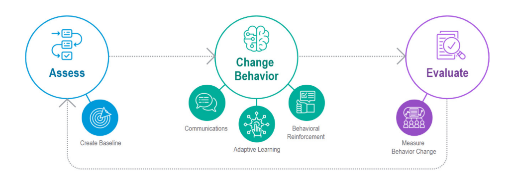
Figure 1: The Proofpoint ACE (assess, change behavior, evaluate) framework.

Proofpoint takes a holistic approach to security awareness training. Our ACE framework—which involves assessing the current state of your security solution, changing behavior and evaluating the results—allows you to drive behavior change and improve your security awareness program over time.