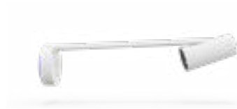
SCRIBE Part # 960-001013 effortlessly share whiteboards in video class