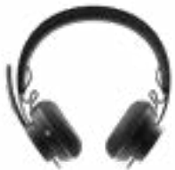
ZONE WIRELESS PLUS