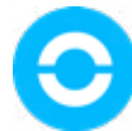
SYNC free cloud-based monitoring and management for Logitech video collaboration gear