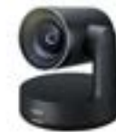
RALLY CAMERA Part # 960-001226