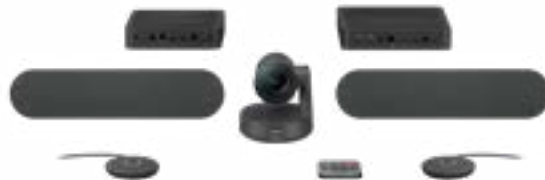
RALLY & RALLY PLUS Part # 960-001217 Plus Part #: 960-001225