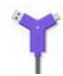
SWYTCY Part # 952-000009 one-cable laptop link to a room's conference camera and display