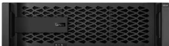
Lenovo ThinkSystem DM Series Storage