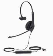
JABRA BIZ 1500