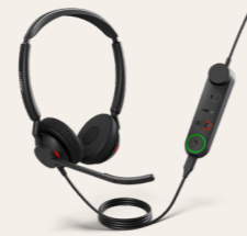
JABRA ENGAGE 50 II