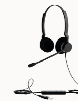
JABRA BIZ 2300