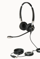
JABRA BIZ 2400 II