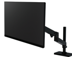
LX Pro Desk Arm, Tall Pole