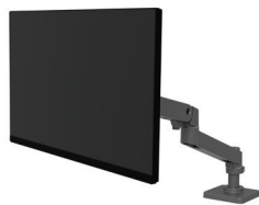
LX Pro Desk Arm