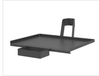
FRONT SHELF DARK GREY 98-417-289