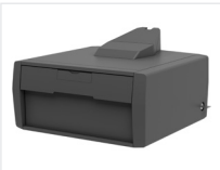
TALL SINGLE DRAWER DARK GREY 97-989-622

Additional accessories available in white