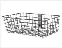
LARGE WIRE BASKET DARK GREY 98-135-282