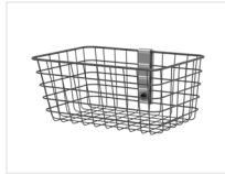
SMALL WIRE BASKET DARK GREY 98-6136-282