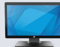
Monitors 7" to 27"