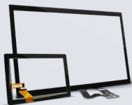
Touchscreens & Controllers 7" to 86"

From design and engineering to prototyping and production, partner with Elo experts to create your industrial device.