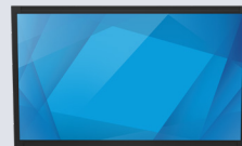
Open Frames 10" to 55"