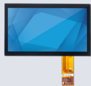
Touchscreen Display Modules 7" to 32"