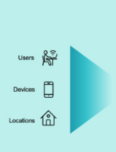
Figure 1: Citrix Secure Access Service Edge