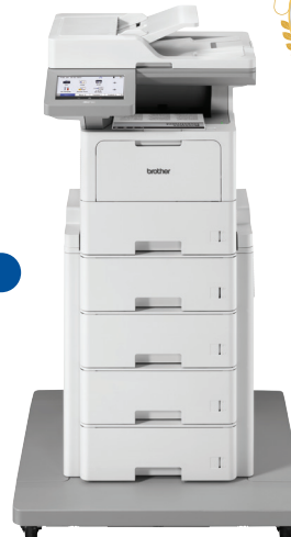
MFC-L6915dw PLUS TOWER TRAY OPTION