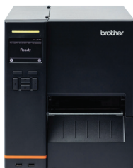
TJ-4420TN / TJ-4520TN TJ-4620TN

Up to 10" per second 21 Up to 600 1-inch labels per minute 20