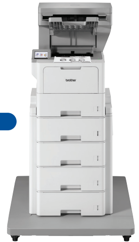
HL-L6415dw PLUS TOWER TRAY AND STAPLER FINISHER OPTIONS