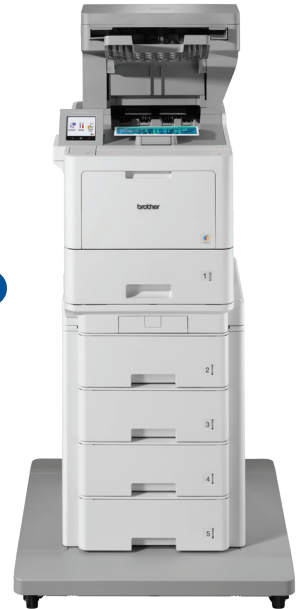
PRINTER SHOWN WITH OPTIONAL TOWER TRAY, CONNECTOR, AND STAPLER FINISHER