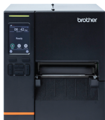
TJ-4021TN / TJ-4121TN

Up to 10" per second 21 Up to 600 1-inch labels per minute 20