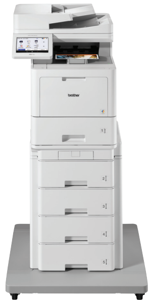
ALL-IN-ONE SHOWN WITH OPTIONAL TOWER TRAY AND CONNECTOR