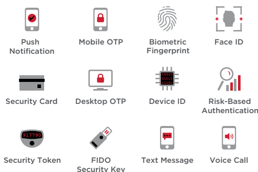
Figure 1: Authenticators