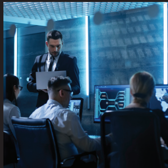
Fiber to the Desktop