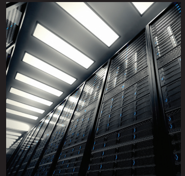
Data Center and Infrastructure