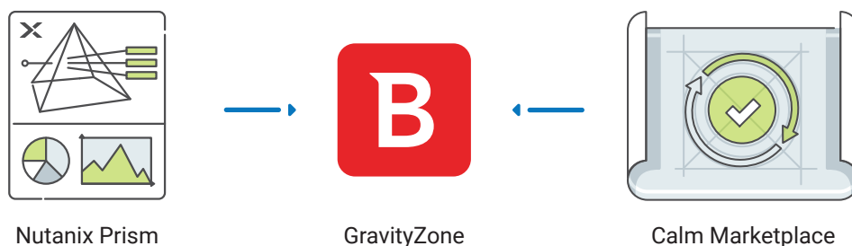
Figure 1. GravityZone can be rapidly deployed as a Calm Marketplace Blueprint or as a VM via Prism.

GravityZone uniquely integrates with Nutanix, supporting fast, automated provisioning in a wide variety of virtualized environments. Out-of-the-box automation allows IT teams to spin up thousands of secured virtual machines in a matter of hours. Being truly hypervisor-agnostic, GravityZone eases the transition to Nutanix Acropolis Hypervisor (AHV) from other virtualization platforms and enables seamless movement of protected VMs between public and private clouds, expediting time-to-value.