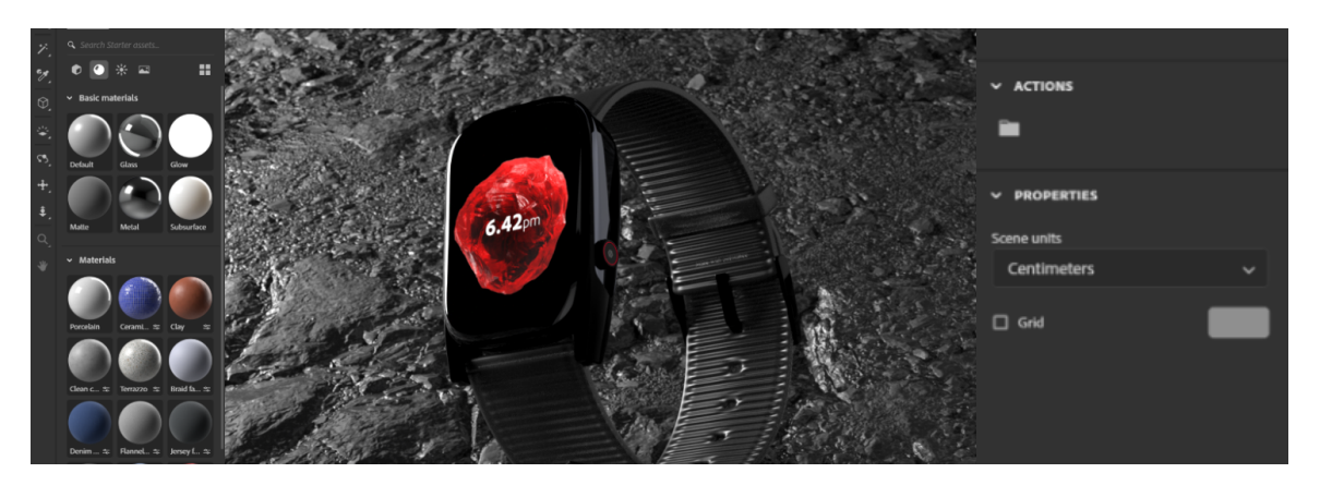
The Substance 3D Collection replicates the user interface of popular 2D design tools.

Not anymore. As Adobe Photoshop did for digital imaging, powerful new apps like those found in the <u>Adobe Substance 3D Collection</u> are throwing open the doors to new levels of creativity for designers of all backgrounds.