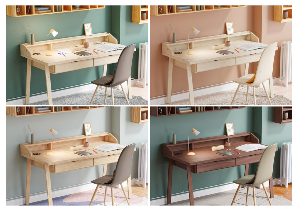
Iterate your designs at the speed of your creativity by quickly swapping lifelike models and materials in and out of your compositions.

By eliminating some of the most time- and resource-intensive stages in the asset creation process, 3D design opens up additional creative possibilities and levels of production. It creates a new kind of digital content supply chain—one nimble enough to meet the increasing demands on designers to generate content for ever-multiplying channels.