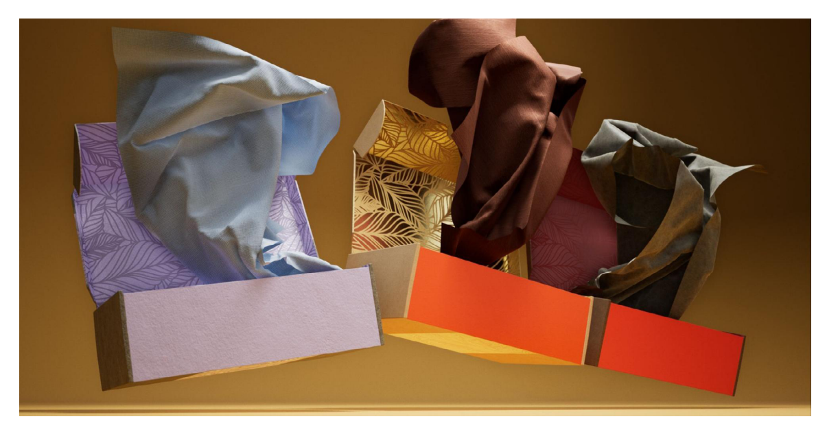
From the positioning of each box to the way the light bounces off the silk, this virtual photo shows the creative control 3D offers designers, who are no longer bound by physics and chance when creating images defined by movement.

The Substance 3D Collection takes each stage and element required for a photorealistic 3D model or scene and offers production-quality assets that users can customize in a nondestructive way. With ready-to-use assets and the ability to import assets from the real world, designers are effectively untethered from the physical realm, leaving them to explore new realms of creative freedom.