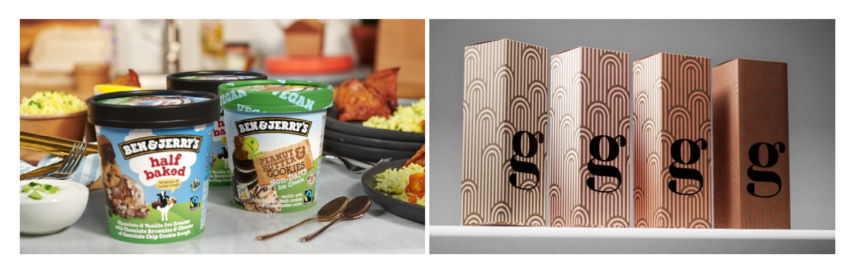
Every material in the Substance 3D asset library comes with built-in customizable parameters, allowing for quick and easy variation.

Gail Cummings Global design lead at <u>Ben & Jerry's</u>