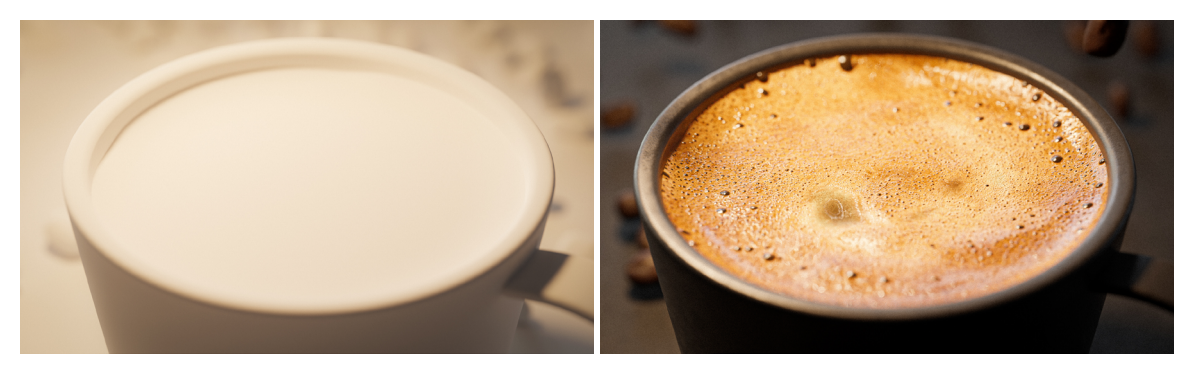
This carefully crafted scene began with plain 3D models of a coffee mug and a few coffee beans. Rich organic textures were then combined with a close-up camera angle, shallow depth of field, and natural lighting to produce the "virtual photo" beside it.

A product "shoot" without cameras. A dozen variations on a product design with just a few clicks of the button. A full set of packaging designs with no physical mockups. These are just a few of the possibilities 3D design offers today's creative professionals. The result: Unprecedented creative freedom, scalability, and design quality—whether you're a 3D expert or just getting started.