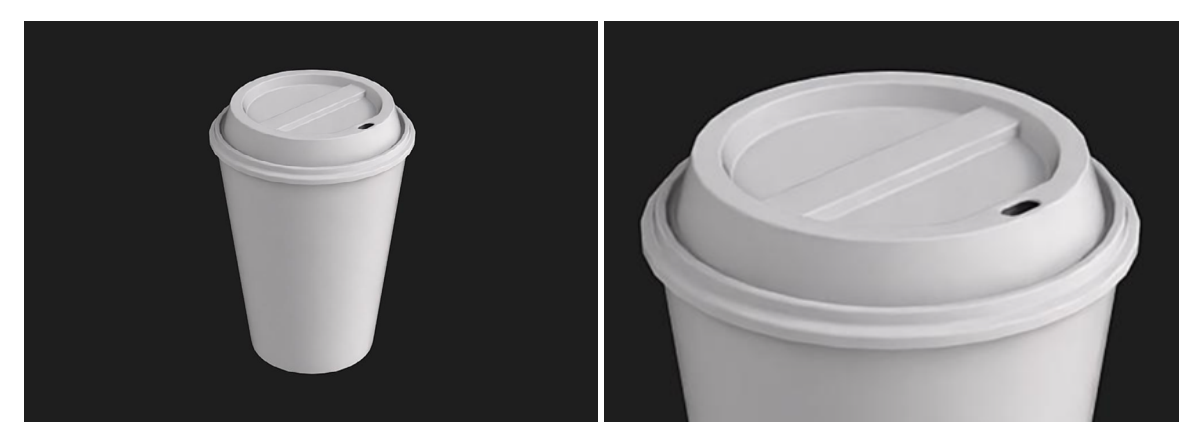
The Adobe Substance 3D asset library comes with thousands of predesigned 3D models, including this to-go coffee cup. You can also import your own to get started.

For those using the Substance 3D Collection, getting started is as easy as selecting a model from the thousands available in the <u>Adobe Substance 3D asset library</u>. Say you're working on the packaging design for a new to-go coffee cup. All you'd have to do is select the model for the industry-standardized cup, and you're ready to go. If you already have a model you want to use, the Substance 3D Collection apps can ingest models in a vast array of file formats—opening the door to infinite iterations of any asset design.