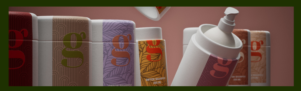
Nikita streamlined her packaging design process using 3D assets, materials, lights, and backgrounds in the Substance 3D Collection.

Finally, it's time to see what her concepts might look like sitting on a salon shelf soaked in natural light or reflecting overhead lights on a buyer's bathroom counter. Substance 3D Stager allows her to simulate different lighting conditions and scenes. When she finally delivers her designs to the client, she includes these images to help expedite their decision-making process.