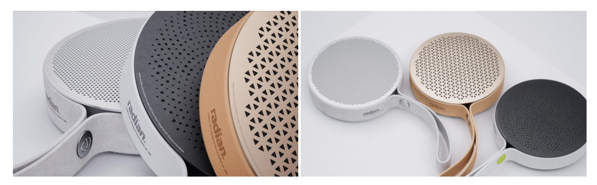
Quickly and easily iterate versions of your product's look with the Substance 3D Collection.

Let's say you're designing a speaker, and you're curious what it would look like if the holes on the speaker itself were smaller or shaped as something other than a circle, or if the cover were a matte plastic versus a high-gloss aluminum. With a 3D-powered workflow, a few clicks are all it takes to find out—and in a level of hyperrealistic detail that allows you and your team to avoid commissioning physical samples until you've all agreed on the product specs.