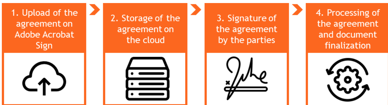
Figure 3 – Workflow of an agreement with Adobe Acrobat Sign

The workflow of an agreement is described in Figure 3. First, the electronic document is uploaded on Adobe Acrobat Sign with information regarding signing parties and locations of signatures. The electronic document is stored on the cloud. Adobe’s cloud vendors, such as Microsoft Azure or Amazon Web Services, store the document on their data centres. Then, the different parties access the document, review it, and sign it. Finally, the document is processed with all signatures, finalized and the agreement is completed.