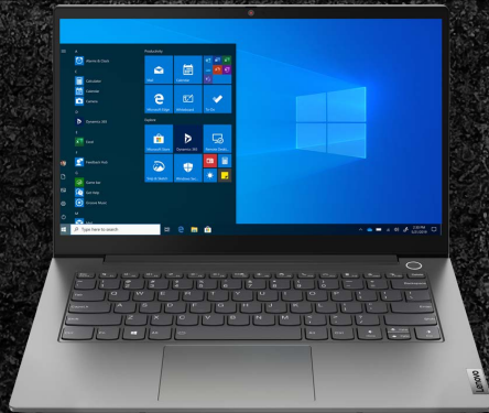
ThinkBook Series B