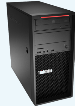
ThinkStation® P520c compact workstation