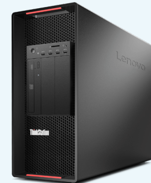
ThinkStation P920 dual-processor workstation