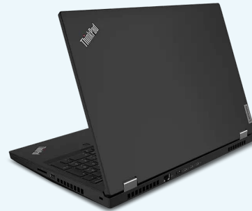
ThinkPad® P15 mobile workstation