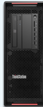
ThinkStation P720 dual-processor workstation