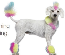
Dog grooming isn't our thing.

Visit the Cisco booth at BTEX to learn more. View floor plan