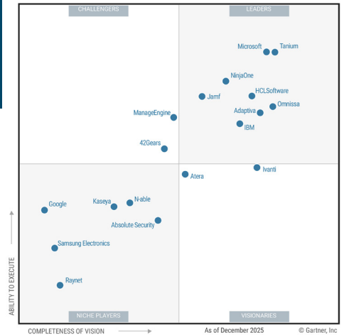
Figure 1: Magic Quadrant for Endpoint Management Tools

Even lean teams deploy NinjaOne in days, not months, and achieve results quickly due to an intuitive interface and streamlined workflows.