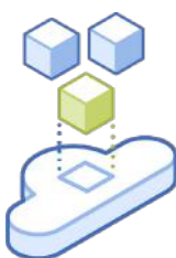
On Demand Elasticity

Extend resources from Private to Public Clouds in Minutes