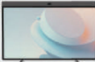
Neat Board 50