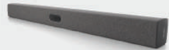
Neat Bar Pro