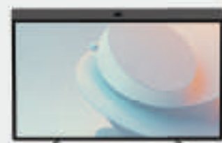
Neat Board 50