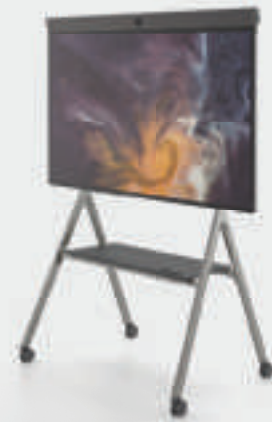
Neat Board (with floor stand)