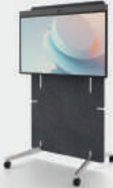
Neat Board 50 (with adaptive stand)