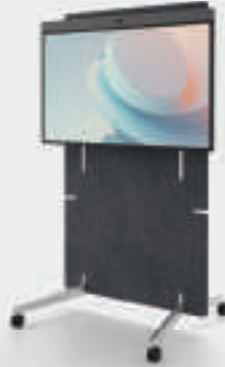
Neat Board 50 (with adaptive stand)