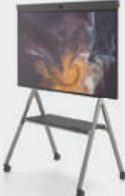
Neat Board (with floor stand)