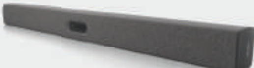
Neat Bar Pro