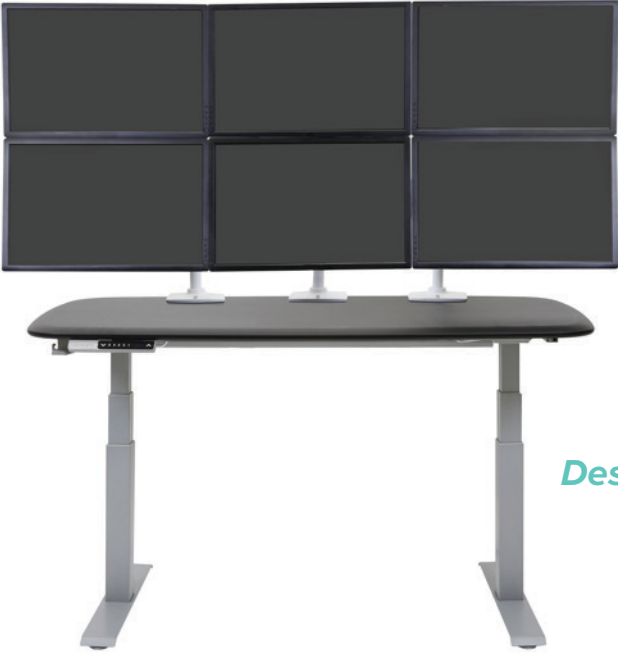
Desk & monitor arms