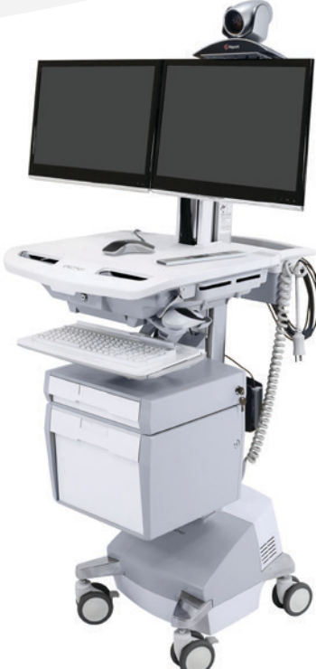
Full diagnostic carts