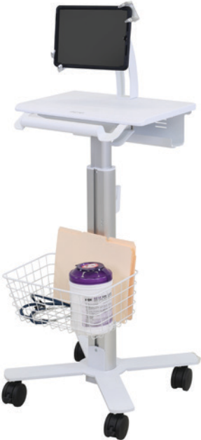
Light-duty medical carts