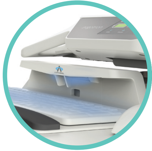
UV ANGEL® AUTOMATED PATHOGEN REDUCTION (COMING SOON)

To support patient-centered care that extends beyond telehealth, we offer professional-grade medical carts for unprecedented mobility. These medical carts are as adaptable as your providers. They easily move to the point-of-care to create a strong connection between the provider, patient and their information, or they fit into busy hallways for documentation.