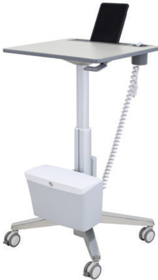
Basic mobile carts

Thoroughly review diagnostic results sitting or standing with ergonomic desks, monitor arms, wall mounts and medical carts. The flexible designs fit a variety of spaces and easily adjust to accommodate clinicians across different shifts. The ability to support multiple screens allows users to simultaneously handle several cases remotely for timely, accurate evaluations.